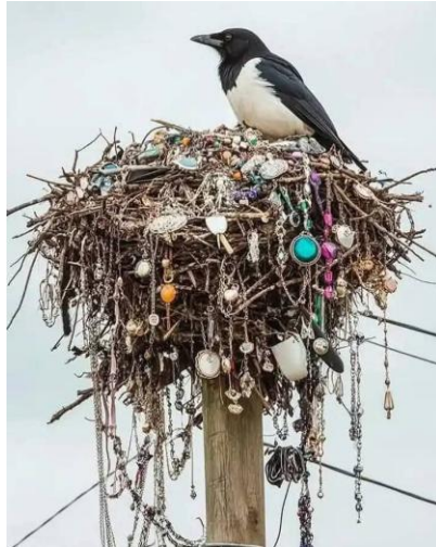
"What are you giving up for Lent?"